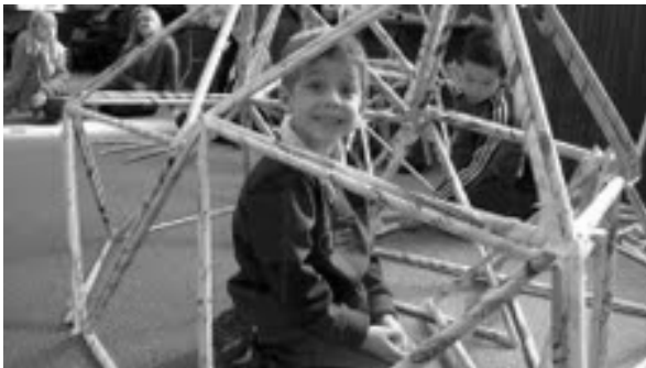
Children build kid-sized burrows at the Architecture Center's "Animal Architects" program.

The Anderson Architecture Center invited children to think like "Animal Architects" at last month's family drop-in program. Various creative "stations" encouraged participants to become architect engineers, developing home design plans for imaginary creatures and creating habitats for animals with Keva blocks.