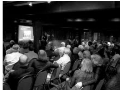
Crowd at Zook home owner event.